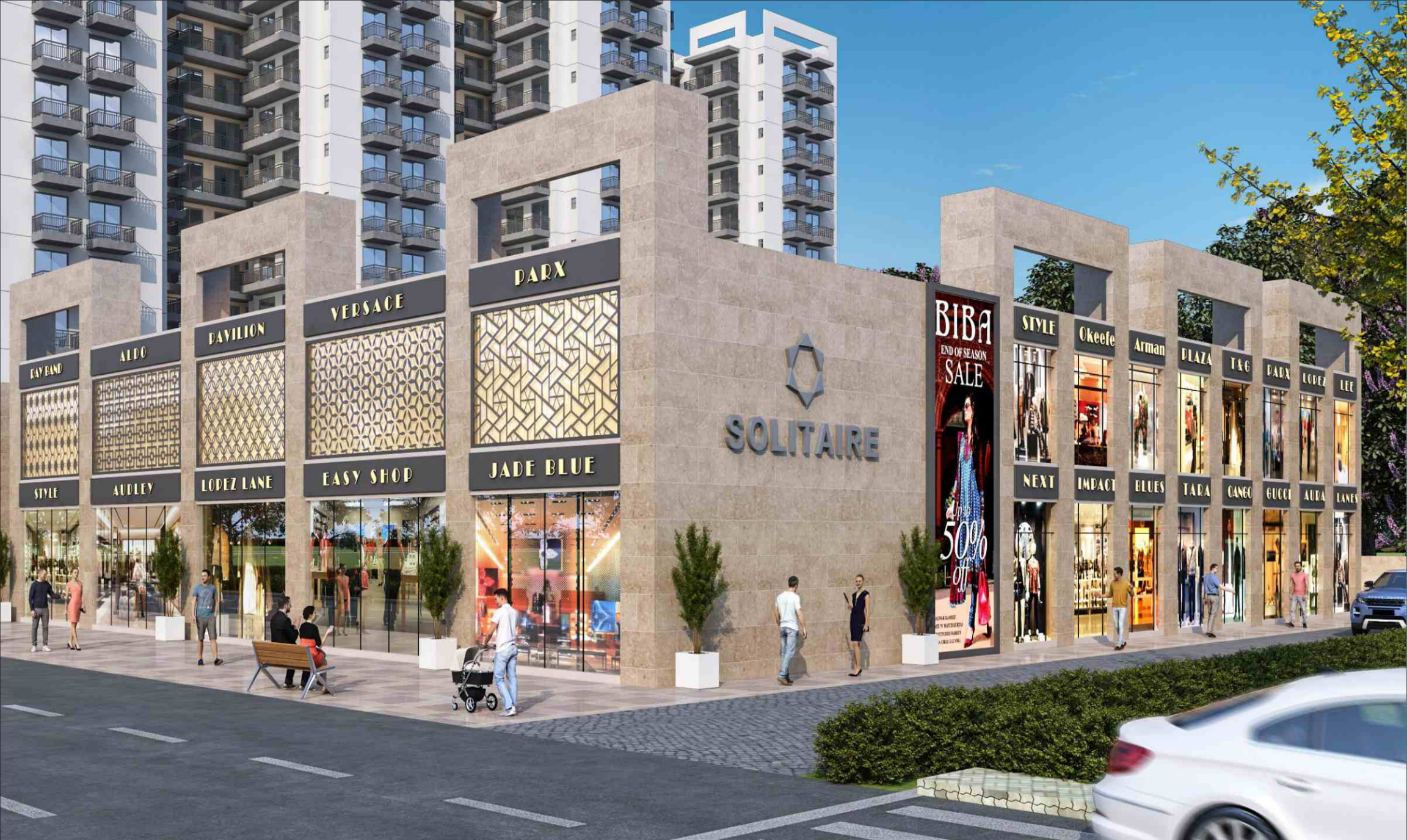
SOLITAIRE 70 , GURUGRAM